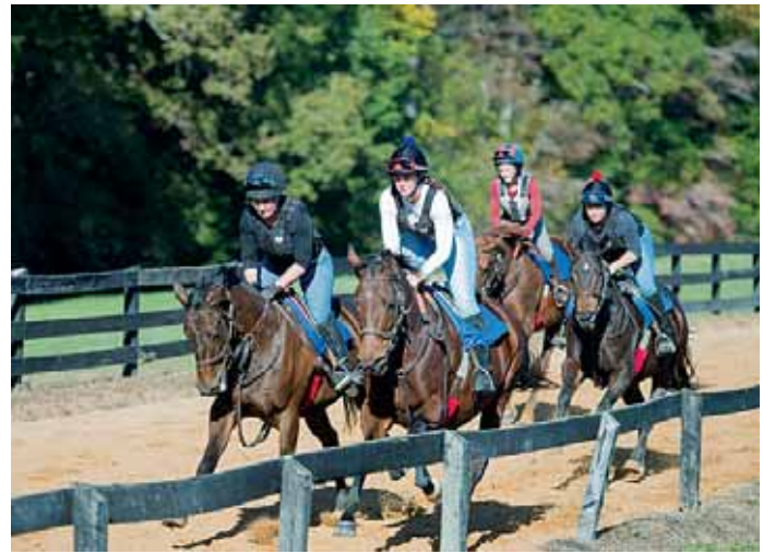
Horses train at the Eagle Point Farm in Ashland, where incentive programs to breed and raise horses in the Commonwealth have helped business.

straight weekends at Shenandoah Downs in the fall and includes a different festival atmosphere each weekend. This autumn, the action kicks off Sept. 15 and runs through Oct. 14. The VEA also supports steeplechase racing and pari-mutuel wagering at the Virginia and International Gold Cups. A new $25,000 maiden race series to all the Virginia Steeplechase meets in 2018 will lead to additional out-of-state horses competing in the Commonwealth.