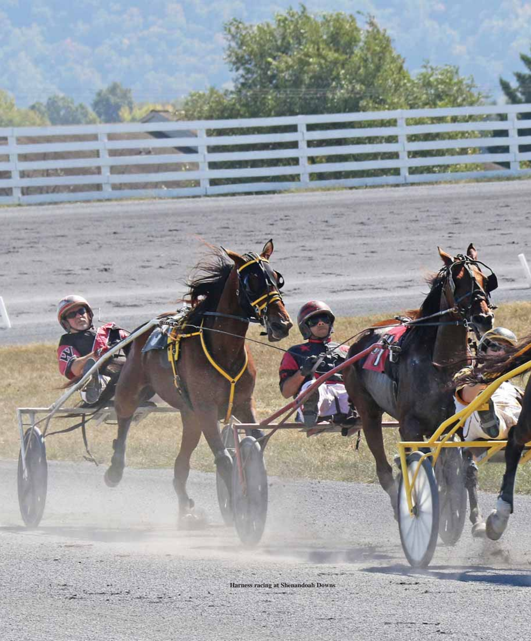
Harness racing at Shenandoah Downs