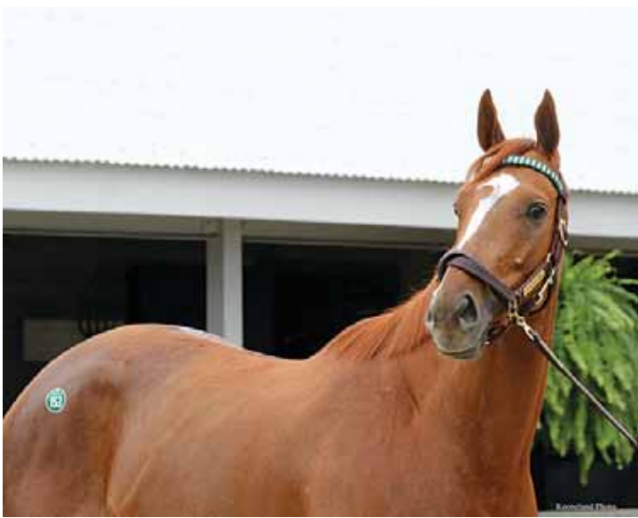
Virginia-bred champ Stellar Wind at the November 2017 sale at Keeneland